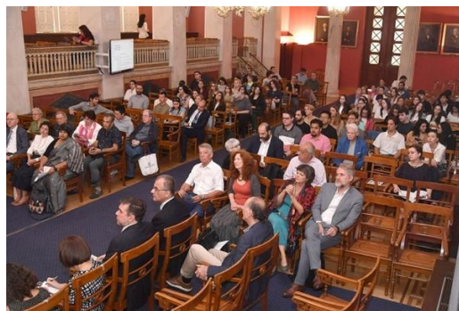
Participants at the Conference Hall, Central building, NKUA

role played by “ Athens in Ancient Philosophy ”. It took place in the central