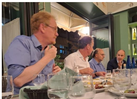
Participants dining after the end of the first day of the Conference

• The new English-language MA in Contemporary Philosophy/Philosophy of Science officially launched in September 2023 with a very successful international conference on “ Contemporary Philosophy meets Philosophy of Science: Trends and Perspectives ”. The conference included speakers from France, Germany, Greece, Italy, and Norway and took place in “Kostis Palamas” Building between 28 and 29 September 2023 .