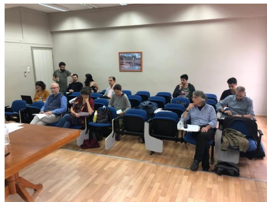
Participants, "Colours in Ancient Medicine"