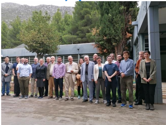
Participants, Symposium on Ancient Greek Mathematics

• From October 25th to 28th 2023 , the European Cultural Centre of Delphi hosted an international event dedicated to the study of Ancient Greek Mathematics, known as the " Delphi International Symposia ".