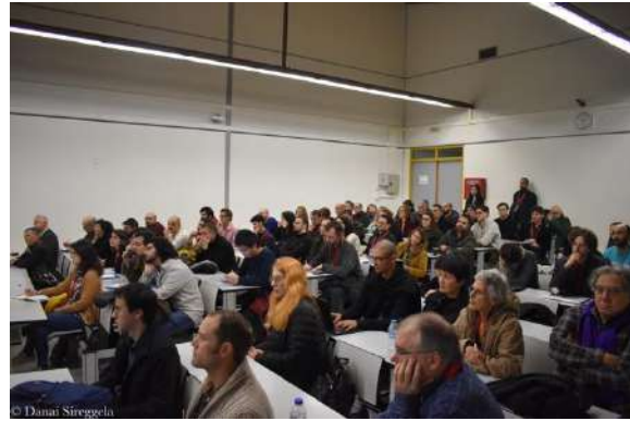
Audience, First Session

• The Department of History and Philosophy of Science of the National and Kapodistrian University of Athens, continuing the established tradition of organising the panhellenic conference on philosophy of science, organised the 8th Panhellenic Conference on Philosophy of Science (December 5-7, 2024 , lecture rooms of the HPS Dept, University Campus). The thematic sections of the 8th PCPS included all areas of philosophy of science (general philosophy of science, philosophy of special sciences), as well as areas of philosophy (metaphysics, epistemology, ethics, philosophy of language, philoso-