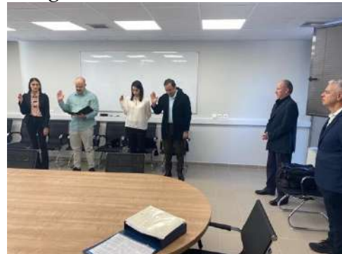
Graduation Ceremony, IFET